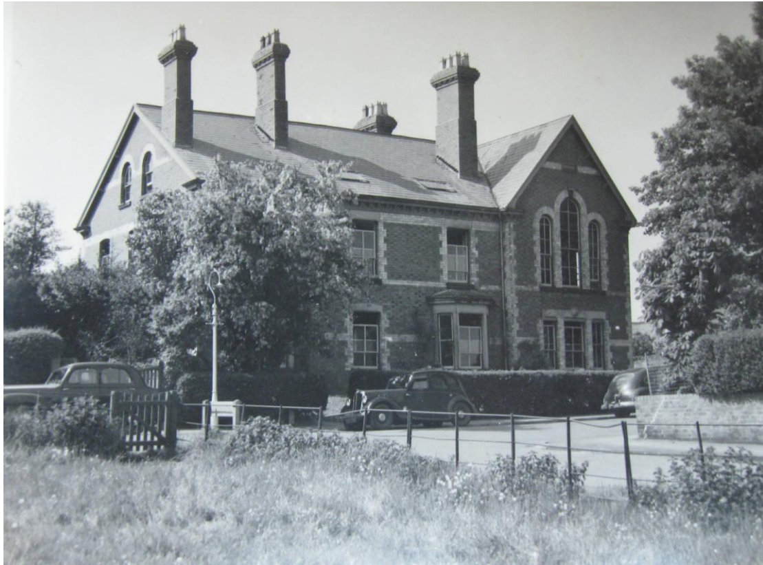
Hat Band Queen's Park School c1951