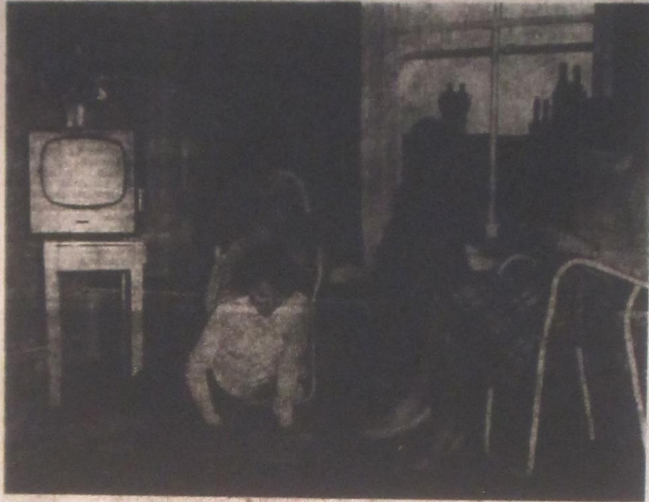
A time for relaxation — Queen's Park School boarders pictured in their common room which is furnished in contemporary style.